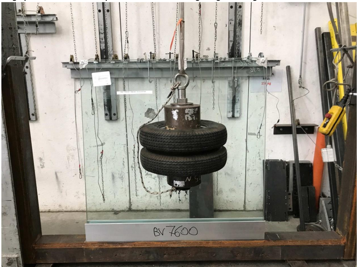
Photograph of the item after impact on the centre of the glazing according to standard UNI EN 14019:2016