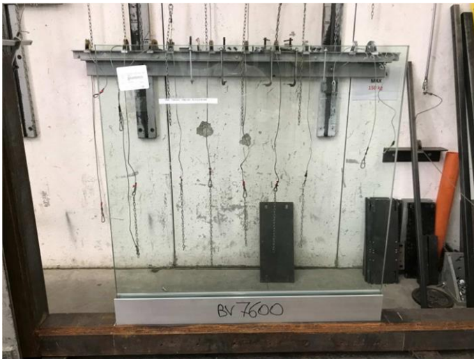
Photograph of the item