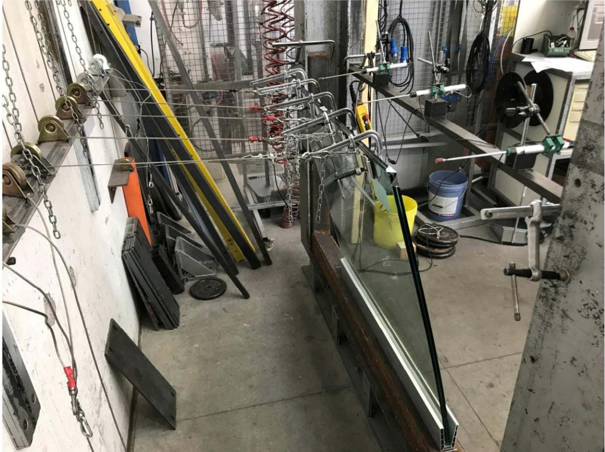
Photograph of the item undergoing horizontal linear static load