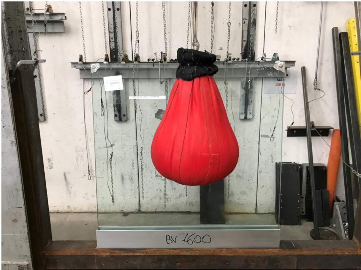
Photograph of the item after impact on the centre of the glazing according to standard NF P01-013:1988